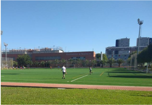
University of Valencia

The training workshops in Valencia were held on June 13 th and 14 th 2019, in the premises of the Faculty of Law. The Agenda for the same has been attached.