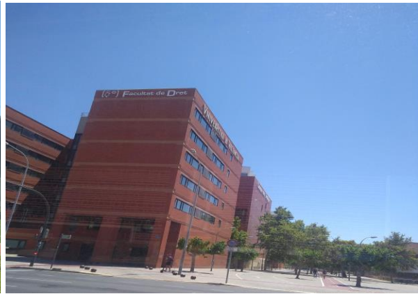
Faculty of Law, University of Valencia (Venue of the two-day EQUAMBI Training)