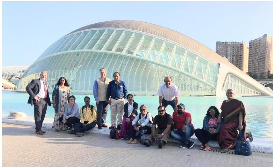
Visit to City of Arts and Sciences