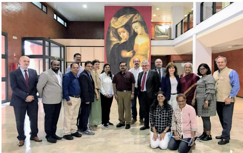
Group Photograph EQUAMBI Indian Participants with Representatives from University of Valencia, ANECA & University of Barcelona