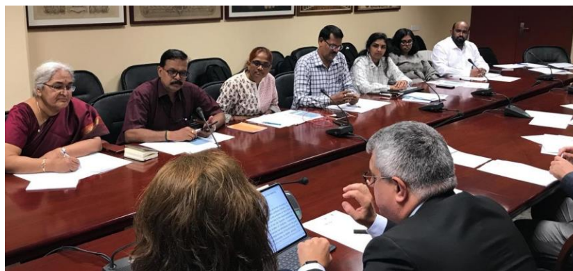
Consortium Members at the Inaugural Session at Valencia

The introductory session was followed by theme-based sessions.